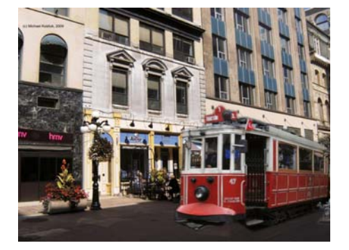
Simulated depiction of streetcar on Sparks Street

Run a small-sized, heritage-style streetcar on a single track along Sparks Street from the new Convention Centre to Lebreton Flats and the War Museum.